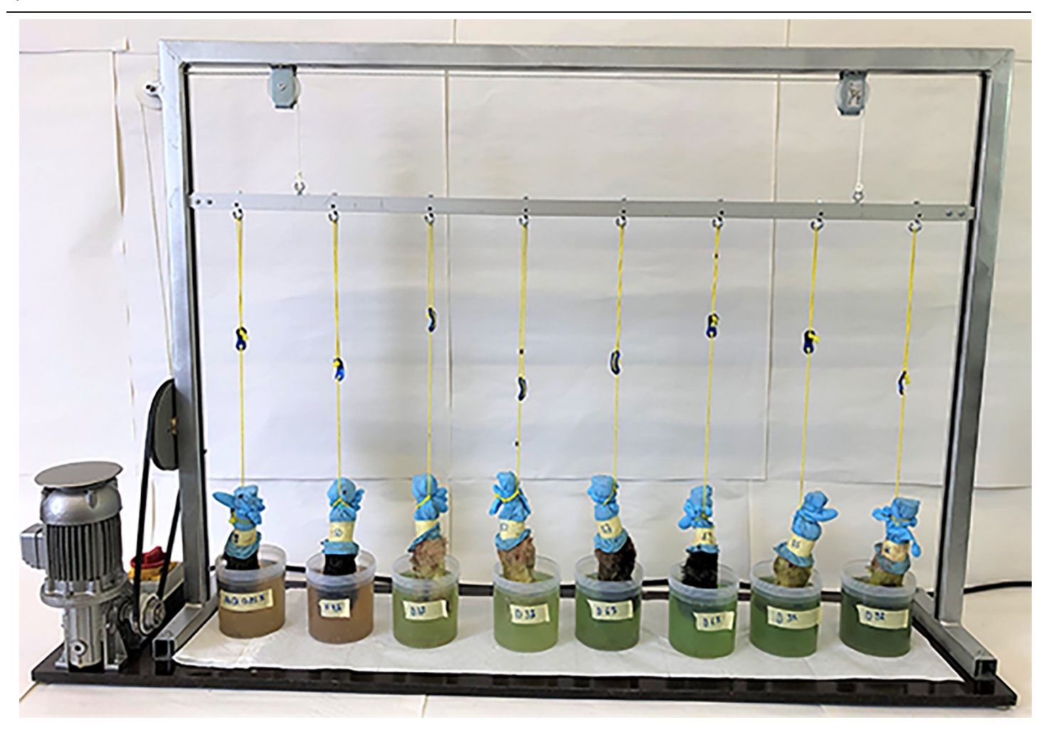
Fig 1. Foot-dipping machine. The foot-dipping machine simulates the movement of alive sheep feet in disinfectant footbath solution.

https://doi.org/10.1371/journal.pone.0229066.g001