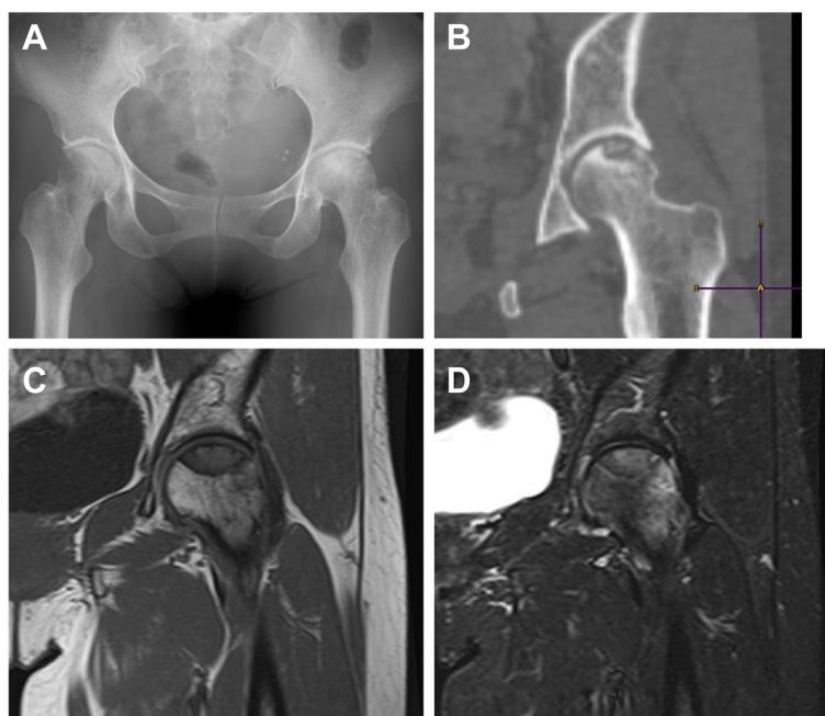
Fig. 1 a X-ray of the hip joint showing left partial femoral head collapse. b CT image showed a lesion in the loaded part of the left femoral head. c Coronal T1 weighted image (T1WI) on MRI, showing low intensity of the left femoral head lesion. d Coronal short tau inversion recovery (STIR) on MRI, showing partially high intensity of the femoral head lesion

DTC is one of the most curable cancers [12]. DTCs are characterized by a slowly progressive course, and have a 10-year survival rate of 80–95 % [2]. However, the occurrence of distant metastases reduces the overall 10-year survival rate to 40 % [13]. Previous studies have reported that 25 % of metastases were to the bone, 49 % to the lung and 15 % to both. Bone metastases have been reported in 2–13 % of patients with DTC, being significantly more frequent in patients with follicular cancer (7–28 %) than in those with papillary cancer (1.4–7 %) [13–15]. The patient described here had follicular cancer.