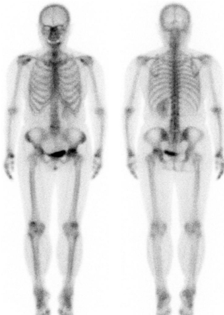
Fig. 2 Bone scan showing that the only metastatic lesion was in the femoral head

Patients with thyroid cancer and bone metastases have a poor prognosis, with 10-year survival rates ranging from 0–34 % [16]. Complete resection of bone metastases of DTC has been associated with a significant improvement in survival [3, 17].