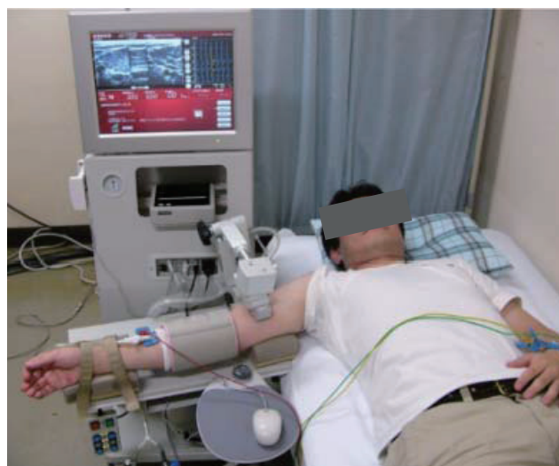
Fig. 1. Measurement of flow-mediated vasodilation (FMD) of the brachial artery

Several methods have been developed and performed for the assessment of endothelial function in humans 9 . Endothelial function tests performed in the coronary artery, including the epicardial endothelial function test and coronary microvascular function test, have been considered as the gold standard techniques for the assessment of endothelial function. These techniques enable direct assessment of endothelial function in the clinically important vascular bed. However, coronary endothelial function tests are lim-