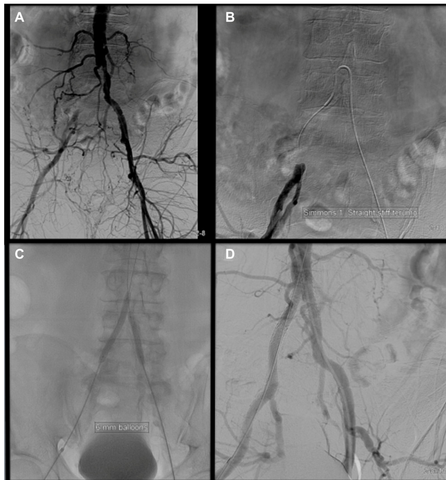
Figure 1 Balloon-expandable stent placement for treatment of bilateral common iliac artery disease.

Although few comparative studies exist to determine the relative efficacy of one iliac stent compared with others, several anatomic subsets may favor use of one stent type over another. Table 3 lists relative advantages and disadvantages of different types of iliac stents.