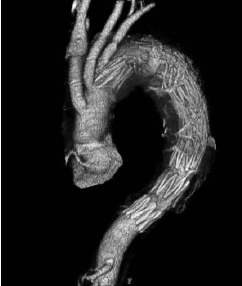
Figure 3 Second-stage TEVAR using the elephant trunk graft as the proximal landing zone.