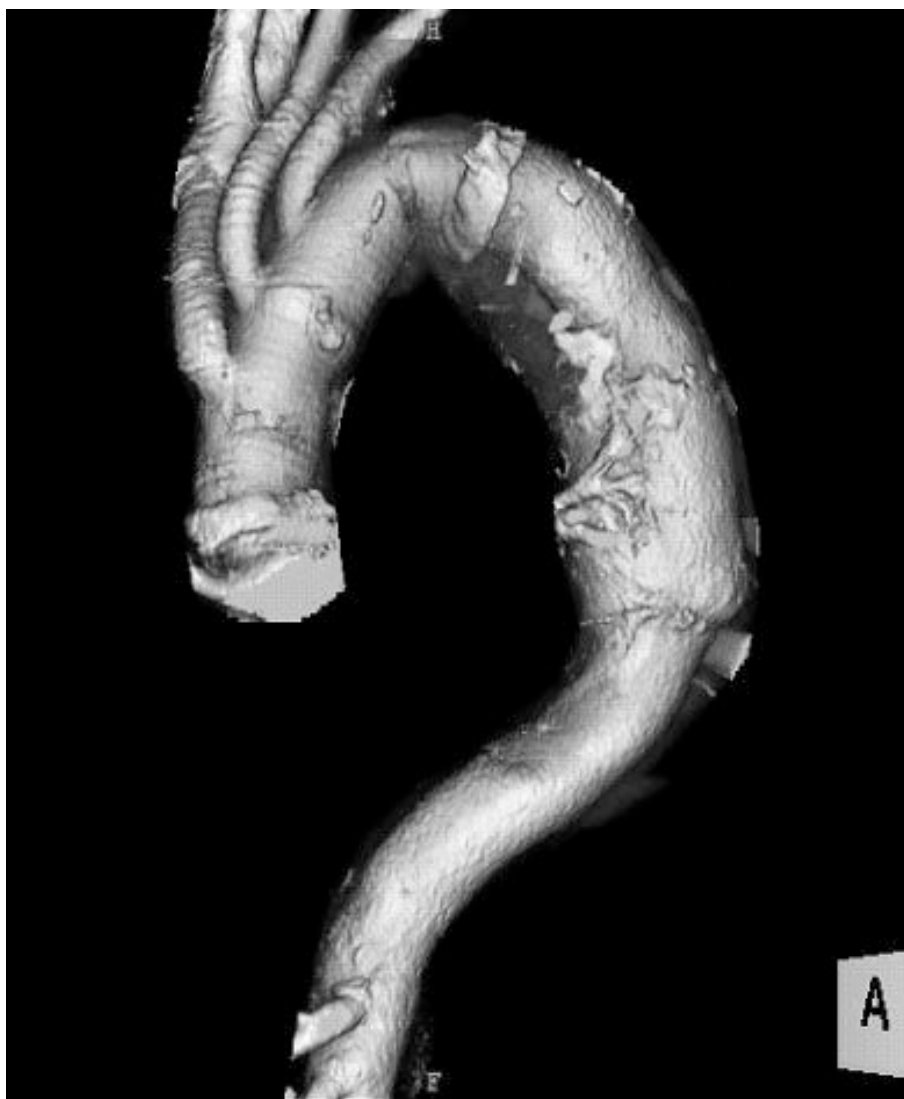
Figure 2 After total aortic arch replacement with an elephant trunk procedure.

In cases with multiple adjacent aneurysms, a single-step procedure is theoretically possible, but because of excessive invasiveness, surgical outcomes may be poor [2,3]. According to a report by the Japanese Association for Thoracic Surgery, the hospital mortality rate after arch-descending aortic replacement is significantly worse than after TAR (14.3% vs. 6.5%, p < 0.001 ) [2]. Kouchoukos et al [3] performed single-stage repair using a clamshell incision in 46 patients and reported hospital death in only 3 patients (6.5%). However, 17% required a rethoracotomy for hemostasis, and other complications in survivors were reported, including mechanical ventilation for 72 hours or more in 42% (tracheotomy in 13%), and transient cerebral ischemia in 13%. On the other hand, when multistage surgery is selected to reduce surgical invasiveness, the surgical priority of multiple