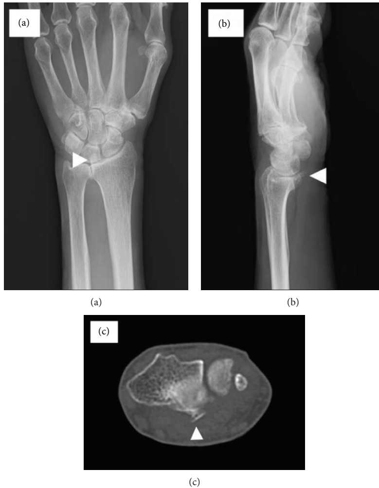
FIGURE 1: Clinical examination. (a) Bony spur on the anterior-posterior plain radiograph of the wrist joint (white arrowhead). (b) Bony spur on the lateral plain radiograph of the wrist joint (white arrowhead). (c) Bony spur on computed tomography (white arrowhead).

During surgery, under general anesthesia and using tourniquet control, a zig-zag incision was made at the level of the DRUJ on the palmar side. Surgical exploration confirmed that at the wrist joint level, the flexor digitorum profundus (FDP) of the index finger had undergone degeneration and complete rupture. The flexor digitorum superficialis (FDS) of the index finger was elongated and thinned. The FDP of the middle finger had undergone slight degeneration; however, tension of the FDP of the middle finger was normal (Figure 2(a)). The bony spur toward the volar side was covered with a joint capsule (Figure 2(b)). The volar capsule of the DRUJ had a pinhole-sized perforation (Figure 2(b)). There was synovial fluid from the pinhole-sized perforation (Figure 2(b)). Resection of the bony spur and the DRUJ capsule repair were performed. Then we performed single-stage reconstruction of the FDP of the index finger with a right palmaris longus bridge graft using interlacing 4-0 nylon sutures.