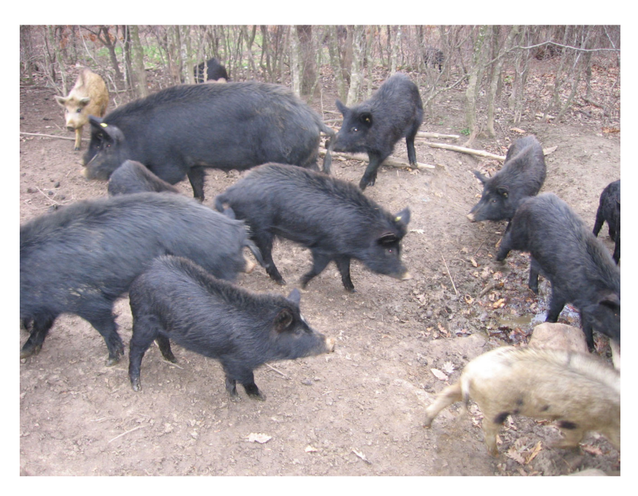
Figure 1. Anthropometric view of East Balkan swine (Sus scrofa).

In recent years, hepatitis E virus (HEV) has been increasingly common in humans and animals. HEV is a single-stranded positive-sense RNA virus [2,3]. HEV is classified into the Hepeviridae family, divided into two genera: Ortohepevirus and Piscihepevirus [2]. Ortohepevirus includes four species: Orthohepevirus A , Orthohepevirus B , Orthohepevirus C and Orthohepevirus D [2,4]. The genus Piscihepevirus has only one species— Piscihepevirus A , and one genotype—cutthroat trout HEV [2].