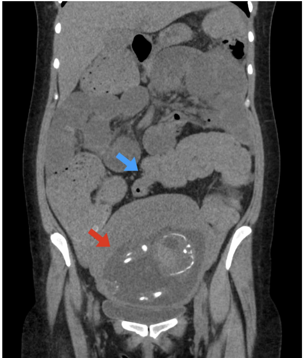
FIGURE 1: Coronal reconstruction from CT scan of the abdomen and pelvis demonstrating colonic distention with abrupt transition to complete collapse in the region of the sigmoid colon (blue arrow) and gravid uterus (red arrow)