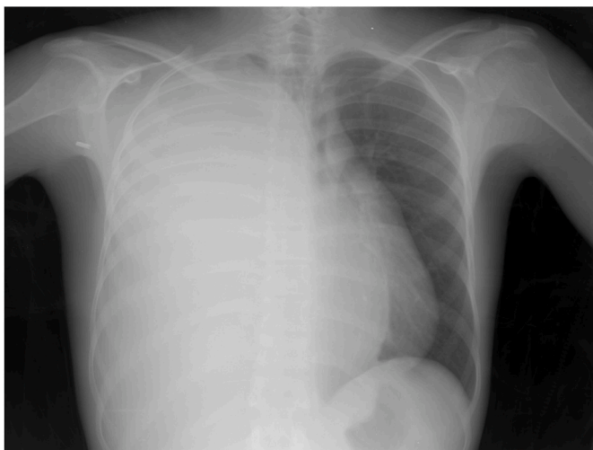
Fig. 1. Patient's chest X-ray: a complete opacification of hemithorax on the right side.

Hydatid cysts can develop in multiple locations in the body, Intra-thoracic but extrapulmonary disease; involving the presence of hydatid cyst in the pleura, heart, pericardium, mediastinum, chest wall, and diaphragm, is an extremely rare clinical entity which represents a diagnostic challenge, especially in cases without a primary cyst in a common location [5]. Most primary hydatid cysts develop in the lung or in the liver, while secondary cysts could be found anywhere due to the possibility of haematogenous dissemination [6]. The most common mechanism of pleural hydatidosis is the formation of the cysts secondary to a primary one, as concluded in the first important study on secondary pleural hydatidosis in 1937 by Dévé, who proclaimed that primary