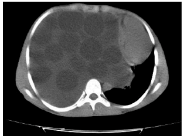
Fig. 2. Patient's CT scan: multiple round-shaped cystic formations filling up the entire right pleural cavity.