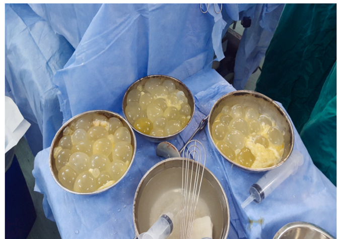
Fig. 3. Hydatid cysts after extraction from pleural cavity.