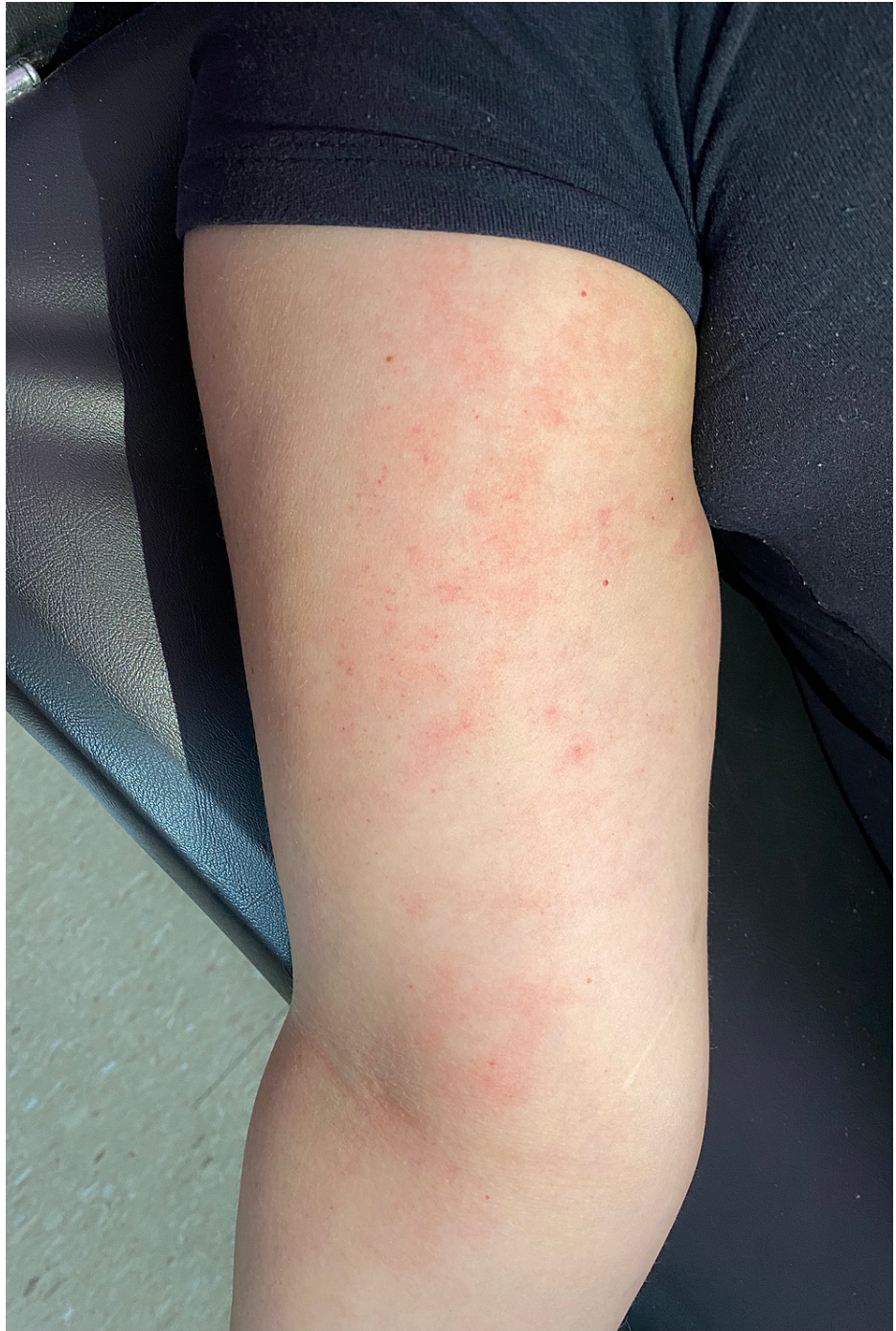
FIGURE 1: Initial urticarial rash on the left upper limb.