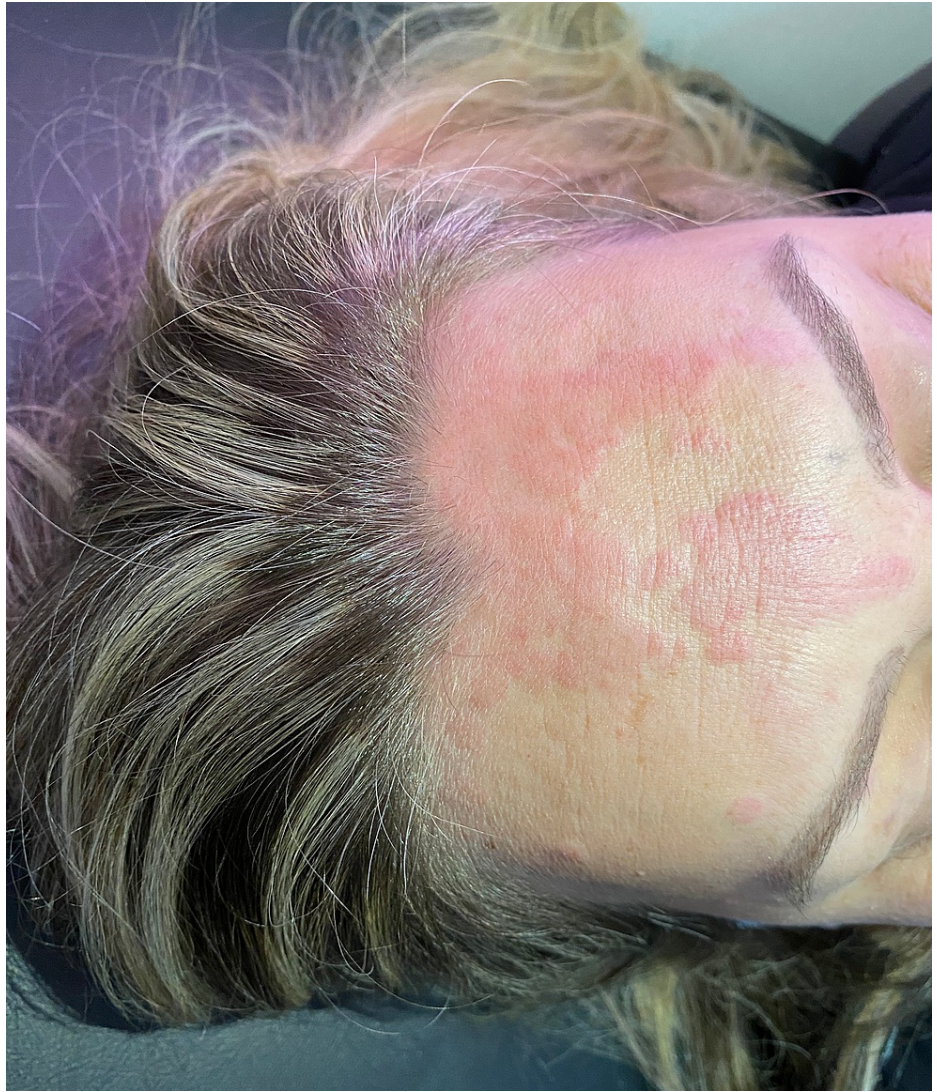
FIGURE 2: Erythematous plaques on the forehead.