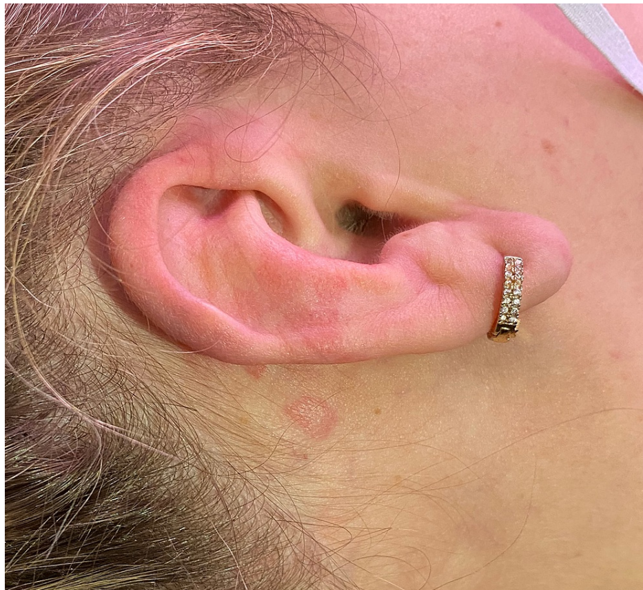
FIGURE 3: Erythematous plaques on the right ear.