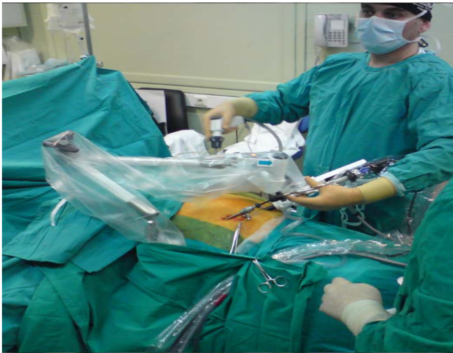
Fig.2. The operation was performed by only one surgeon, without any assistants. The FHLCC was placed in the umbilical port