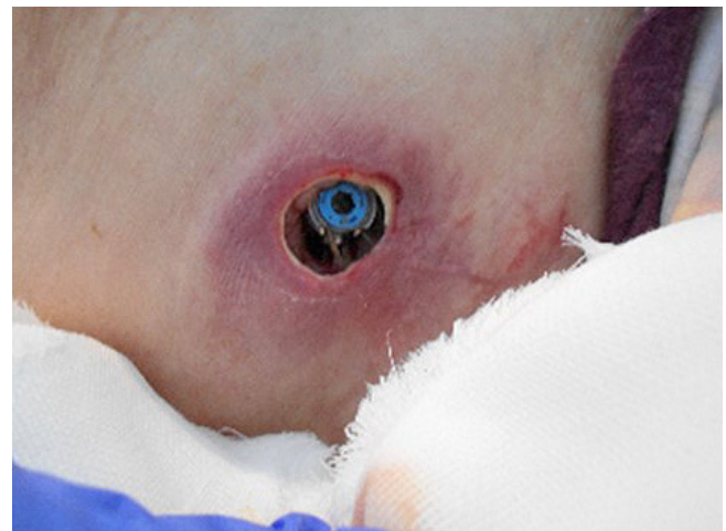
Figure 2. Local findings indicating skin disorders. The screw head was found on the skin (Case 3).

We observed one case of poor reduction of dislocation in