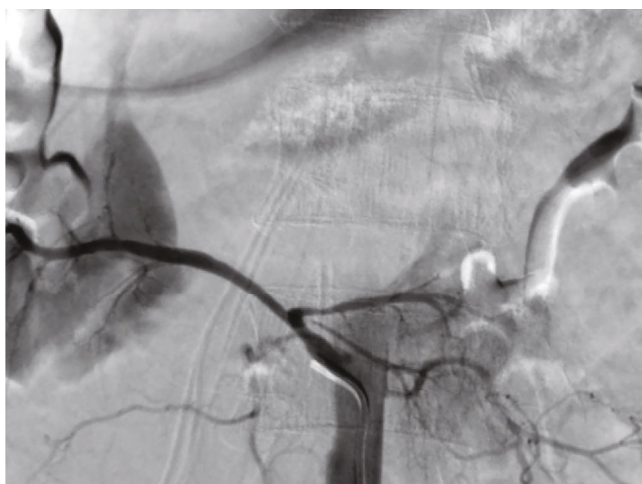
FIGURE 3: Angiogram before embolization. None of the eight patients was reported to suffer renal impairment. PR: pulse rate; BP: blood pressure; AAST: American Association for the Surgery of Trauma; PCD: percutaneous drainage.

a blunt force injury to a kidney with preexisting disease is found in 19% of all kidney injuries, suggesting that diseased kidneys are more vulnerable to violence than normal kidneys [3]. The most common presentation of a patient with blunt force injury of the kidney includes gross hematuria, frank pain, and retroperitoneal bleeding or a hematoma. We should have elevated suspicion that a preexisting kidney injury exists when the injury is due to a low-impact velocity blow with no injury of the intra-abdominal organs [3].