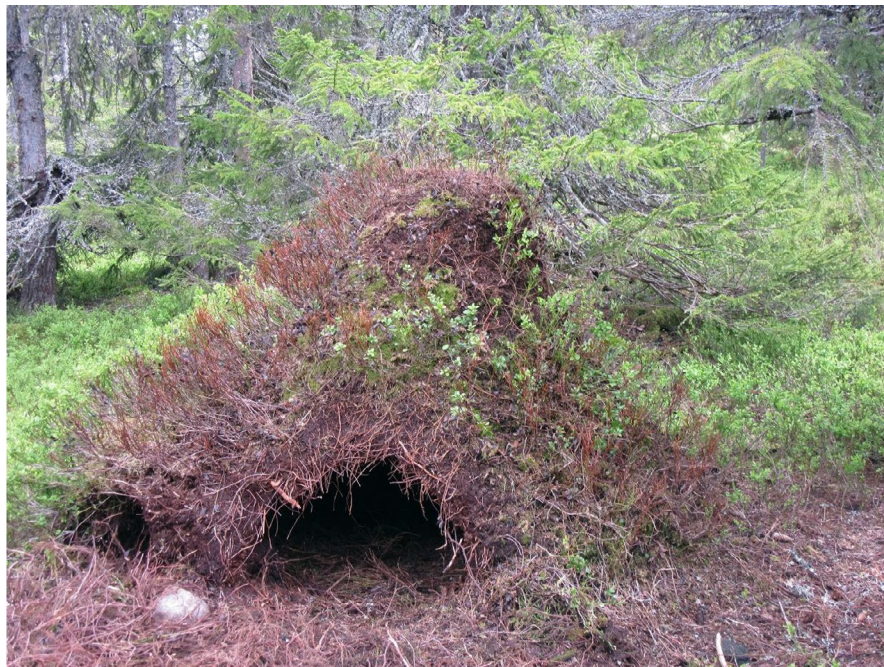
FIGURE 1 A winter den of a brown bear excavated in an abandoned anthill in Sweden

In addition to the attributes of excavated dens, several other factors may affect the prehibernation body condition and energy loss of bears during hibernation. Loss of body heat during hibernation can be exacerbated by severe winter temperatures (Tøien, Blake, & Barnes, 2015), even if the animal is hibernating in an enclosed cavity (Thorkelson and Maxwell 1974). The amount of snow may positively affect energy conservation during hibernation by enhancing insulation (Beecham et al., 1983; Servheen & Klaver, 1983; Sorum et al., 2019; Vroom et al., 1980; Wathen, Johnson, & Pelton, 1986). Energy loss and body mass in bears during hibernation are highly affected by prehibernation body condition (Atkinson & Ramsay, 1995; López-Alfaro, Robbins, Zedrosser, & Nielsen, 2013; Zedrosser, Dahle, & Swenson, 2006). Larger bears potentially gain more fat and lean mass prior to denning (Manchi & Swenson, 2005), considering the positive correlation between body size and body mass (Dahle, Zedrosser, & Swenson, 2006), and thus, males and older bears are assumed to be in a more favorable condition at the onset of hibernation, due to their larger body size (Hilderbrand et al., 1999; Swenson, Adamič, Huber, & Stokke, 2007). Energetic costs and weight loss in bears increase with the duration of hibernation (López-Alfaro et al., 2013), and the duration of denning is sex-dependent (Friebe et al., 2001; Manchi & Swenson, 2005; Pigeon, Stenhouse, & Côté, 2016).