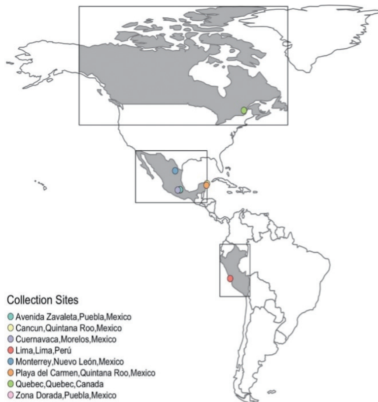
Fig. 1. Collection sites of P. h. capitis lice from México, Canada, and Peru.

(Invitrogen, San Diego, California, USA), restricted with enzyme, and incubated for 4 h at 37°C. The polymorphisms were categorized as follows: susceptible “SS” homozygote (non-cleavable), visualized as a 332-bp band; resistant “RR” homozygote (cleavable), visible as 2 bands (261 and 71 bp); or “RS” heterozygote, visible as 3 bands (332, 261, and 71 bp). The digestion product was loaded on a 1.5% agarose gel containing ethidium bromide for UV light visualization (Fig. 1). To confirm the genotype, samples were sequenced using the Big Dye Terminator v3.1. Cycle Sequencing Kit and the same PCR primers used for amplification. The reactions were analyzed in the ABI PRISM 3,100 Genetic Analyzer using the Sequencing Analysis Software v5.3 (Applied Biosystems) and Gene Studio ver2.2.0.0 molecular biology suite. Genotypic frequencies ( f ) were calculated by dividing the number of lice with a specific genotype by the total number of lice analyzed. Genotype frequencies at the 929 locus were tested to fit the Hardy-Weinberg assumptions using a \chi^2 goodness-of-fit test with one degree of freedom [13]. Wright’s inbreeding coefficient ( F_{IS} ) was calculated using the formula: F_{IS} = 1 - (H_{obs}/H_{exp}) , where H_{obs} is the number of heterozygotes observed and H_{exp} the