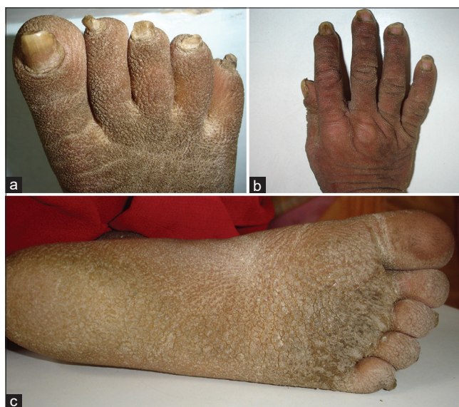
Figure 3: (a-c) Hyperkeratotic and verrucous appearance of hands and feet with yellowish and thickened nails