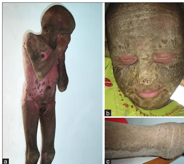
Figure 1: (a) Widespread, severe, hyperkeratotic scaly lesions over erythematous base. (b) Thick hyperkeratotic scaling on face sparing periorbital areas and lips and alopecia on scalp and eyebrows. (c) verrucous appearance of skin of leg

The patient was treated with topical emollients and keratolytics i.e., salicylic acid, which led to a significant decrease in keratotic lesions [Figure 4a-c]. She was also advised to wear a hearing aid and undergo auditory rehabilitation. Artificial tears were prescribed by an ophthalmologist. However, she was lost to follow-up after second visit.