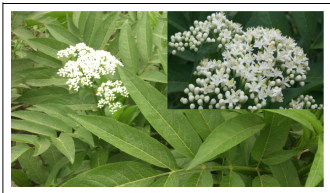
Figure 1. A photograph of Sambucus ebulus from an uncultivated site in Fouman (Gilan province), North of Iran (photo by Marzie Jabbari).

violet in color. S ebulus is native to Southern and Central Europe, Northwest Africa, and Southwest Asia (especially Northern Iran). 11