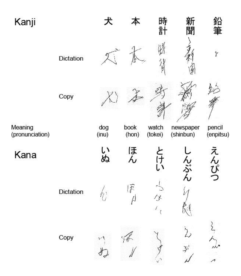
Fig. 3. Most errors were incorrect responses to word dictation, termed paragraphia. The patient could transcribe characters and generally wrote the characters in the correct stroke order, but he often substituted one character for another with a similar shape or sound, perseverated, and wrote characters with 180° rotation (mirror script).

Osawa et al.: Agraphia Caused by Left Thalamic Hemorrhage