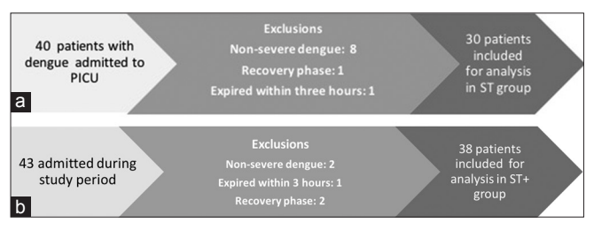
Figure 1: (a)Flow of patients in standard therapy group. (b) Flow pattern of patients in ST + group

Among the ST+ group, all the seven patients who needed emergent intubation received preemptive strategies to prevent