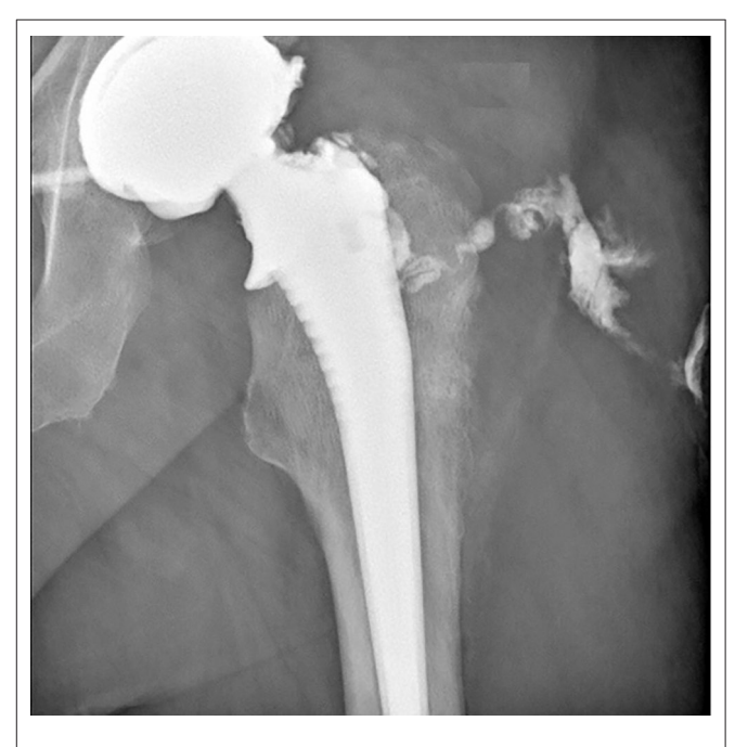
FIGURE 1 | Arthrography showing the fistula pathway.

The functional score for Postel Merle d'Aubigné (36) rose from 12 (9–15) (95% CI 10.8–13.2) preoperatively to 17 (14–18) (95% CI 14.7–16.3) at 2 years post-operatively with a median