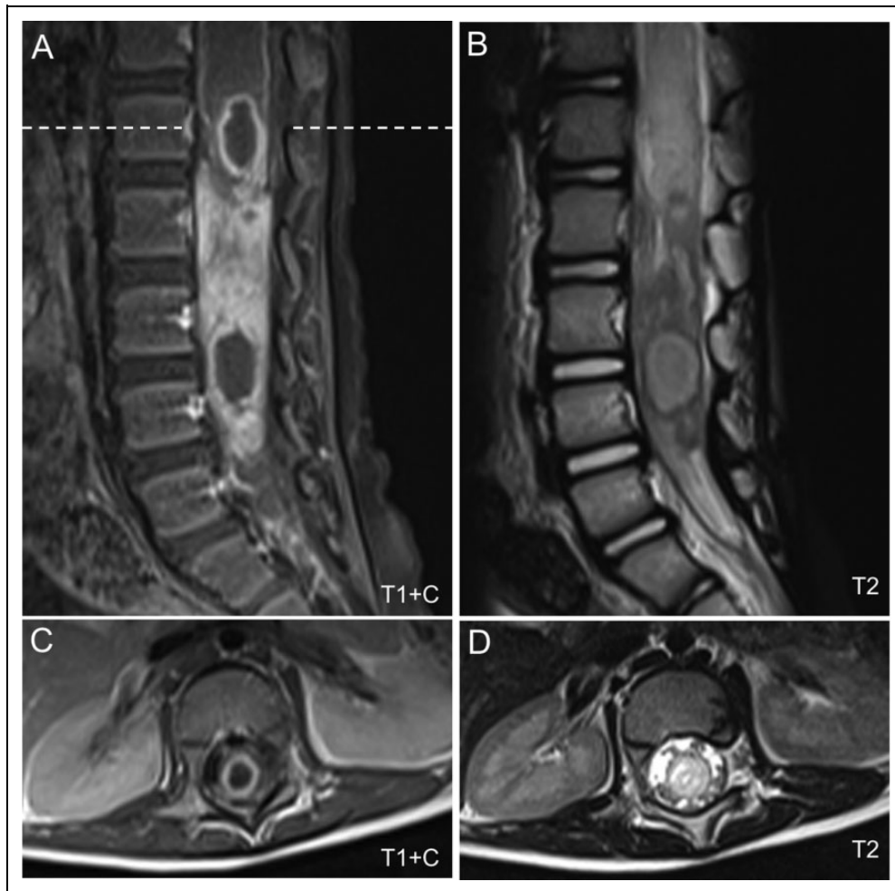
Figure 1. A and B: Sagittal T1 postcontrast and Sagittal T2 images 2 rim enhancing intradural abscesses. The more superior abscess is an intramedullary abscess in the conus medullaris. C and D, Axial T1 postcontrast and Axial T2 images (at the level of the dotted line in A) demonstrate the intramedullary abscess within the conus.