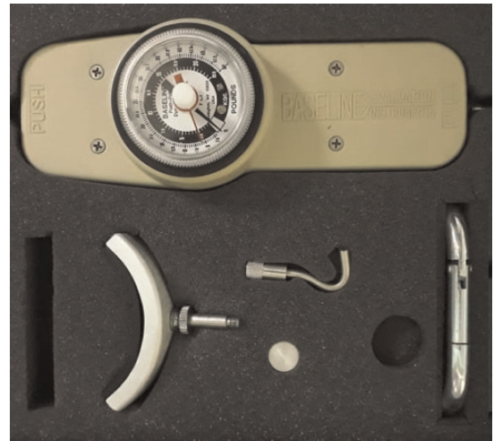
Figure 1. Baseline analog hydraulic push-pull dynamometer.

The intercondylar notch was cleared of fibrous tissue to facilitate good visualization during the preparation of the tunnels. ACL fibers were preserved as a reference for graft