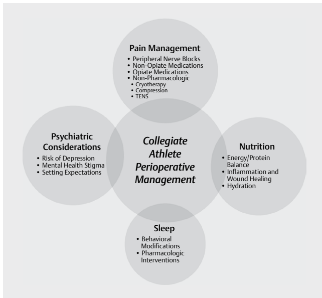
► Fig. 1 Perioperative management considerations in the collegiate athlete. TENS: transcutaneous electrical nerve stimulation.

of the cytochrome P450 system to a reactive intermediate, N -acetyl- p -benzoquinone imine [21]. High NAPQI depletes cellular glutathione stores, and the resulting byproducts damage components of the electron transport chain, including ATP synthase. This process leads to formation of free radicals, damaging liver cells [22]. Consequently, acetaminophen dosage needs to be monitored and kept under 150 mg/kg or 4 g/day for adults. Furthermore, collegiate athletes should be screened for and counseled regarding hepatotoxicity as it relates to alcohol and illicit substance use concurrent with acetaminophen. It is not recommended to combine alcohol with acetaminophen, and patients with non-alcoholic fatty liver disease are also at risk of hepatotoxicity at standard doses [23, 24].