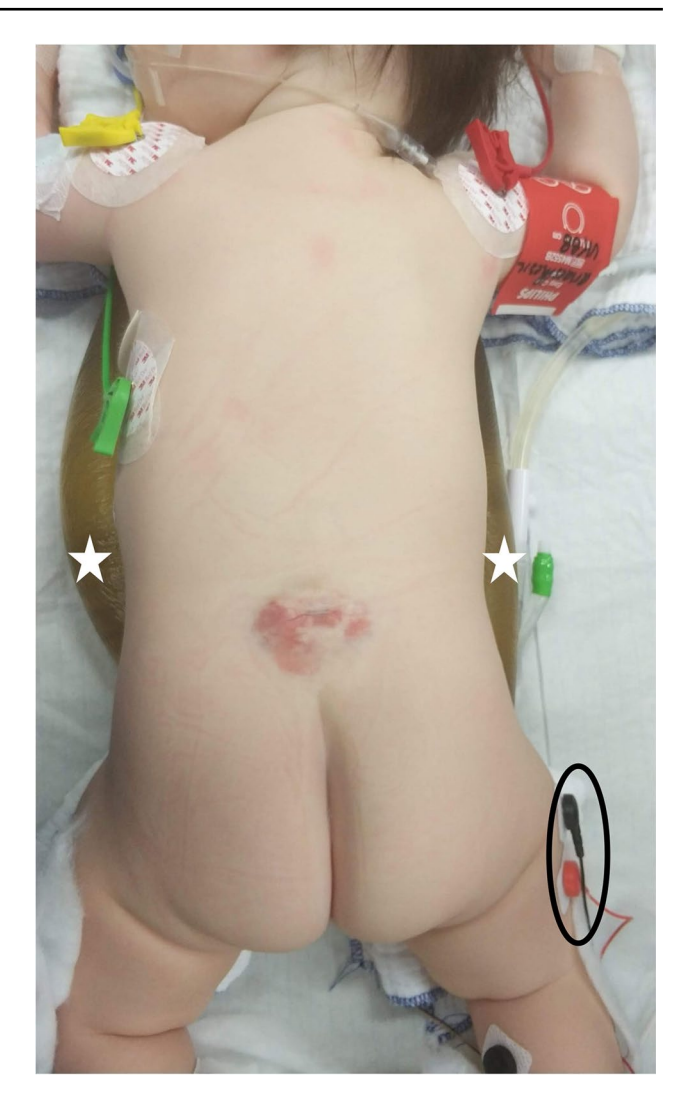
Fig. 1 A 6-month-old female showing typical dermatological stigmata with a hemangioma and deviated gluteal fold. Preoperative prone positioning is shown with padding of all pressure points using jelly pads (white star) and IONM electrodes (black oval) in place (sphincter electrodes not placed yet)

Symptomatic patients diagnosed with FFT and regardless of the level of the CM should undergo surgery. No clear consensus exists for asymptomatic or oligosymptomatic patients with a FFT but normally placed CM or asymptomatic patients with an FFT and a low-lying CM [7, 8]. The advantage of prophylactic surgery (80% of all cases) is to avoid the development of neurologic deficits or