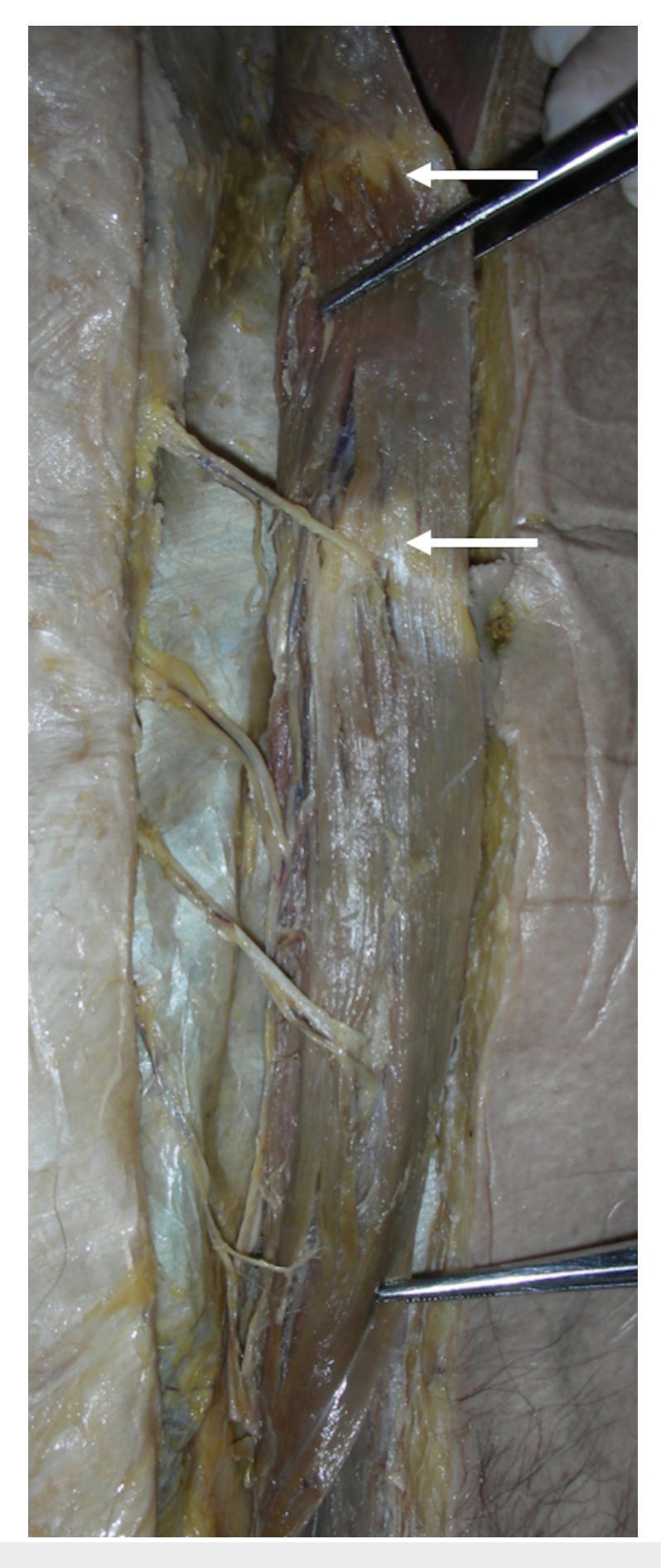
FIGURE 3: Reflection of the right-sided rectus abdominis