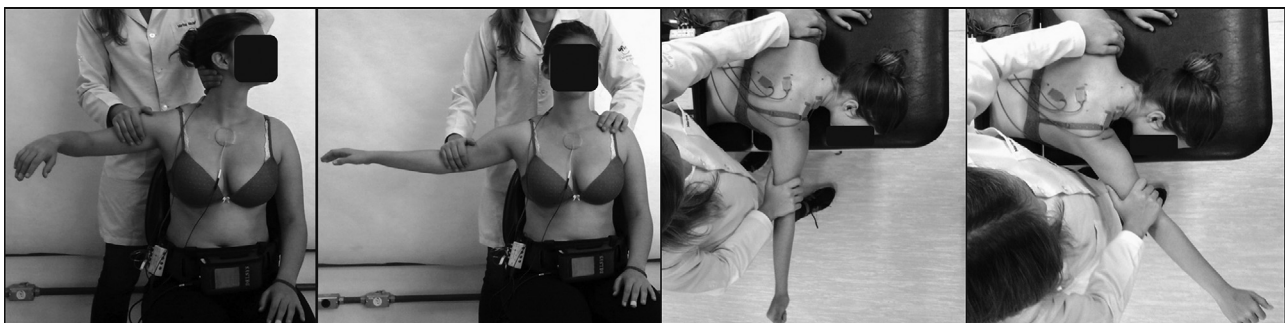
Figure 1 Test positions during maximal and submaximal muscle contractions for the upper-clavicular fibers (a), upper-acromial fibers (b), middle (c), and lower (d) trapezius. Manual resistance was applied for maximal voluntary contractions, as shown in the pictures. The same positions were used for submaximal voluntary contractions with subjects holding a halter of 1 kg.

The within- and between-days reliability, which may be analyzed in order to determine how much a measure are equal, considering repeated measurement in different occasions, 48 was evaluated through the Intraclass Correlation Coefficient, the coefficient of variation (%CV), the standard error of the measurement (SEM and %SEM) and the Bland–Altman analysis. All the tests were run in SPSS (Statistical Package