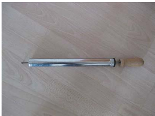
Fig. 1. A standard air pump.