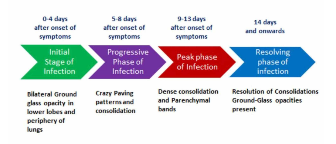
FIGURE 2: Progression of CT findings in COVID-19 patients