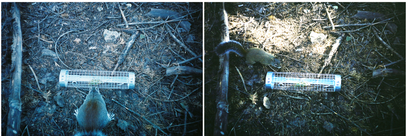
Fig 1. Activity at an Abert's squirrel ( Sciurus aberti ) exclusion cone tube, Pinaleno Mountains, Autumn 2008. Abert's squirrels ( Sciurus aberti , left) were excluded from access to cones in this treatment, whereas Mount Graham red squirrels ( Tamiasciurus hudsonicus grahamensis , right) were able to remove cones.

We measured forest-stand structure and vegetation characteristics in 10 m radius plots [40] centered about the initial placement point of the 30 cone tubes in order to investigate the influence of forest structure on cone removal rates. We recorded average canopy cover determined