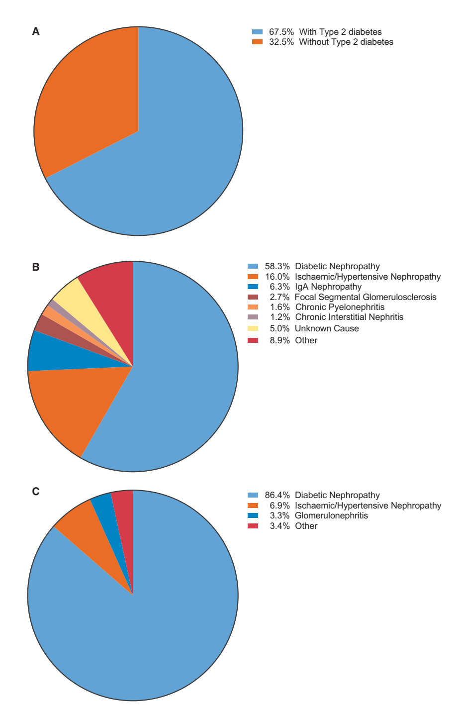
FIGURE 2: Characteristics of study participants: ( A ) study participants by diabetes status, ( B ) investigator-reported causes of CKD in all study participants and ( C ) investigator-reported causes of CKD in study participants with T2D.

97.3 mg/mmol)]. Participants with T2D were more than twice as likely to have had a prior myocardial infarction (11.0% versus 5.1%) or history of heart failure (12.4 versus 7.7%; Table 3).