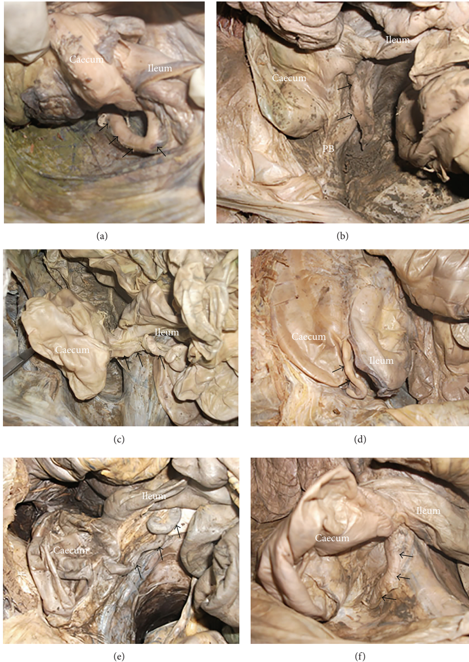
FIGURE 2: Position of the appendix (arrow). (a) Retrocecal appendix (note the appendix curving behind the caecum). (b) Pelvic appendix (note the appendix crossing the pelvic brim (PB)). (c) Preileal appendix. (d) Subileal appendix. (e) Postileal appendix. (f) Subcecal appendix.

surgeons need to be aware of this variation for preoperative planning and better surgical outcomes. Current results postulate that trainee surgeons should not be surprised if the appendix is not easily visualized when a transverse incision is made at the McBurney's point.