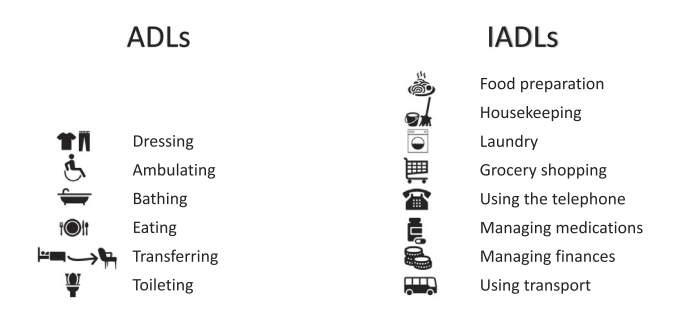
Fig. 1. Components of Activities of Daily Living (ADLs) and Instrumental Activities of Daily Living (IADLs).

The individual components of each are shown in Fig. 1 below. Mohile et al. [60], in a study of more than 900 patients with prostate cancer undergoing radiotherapy, found no difference in toxicity in older patients, but older patients were more likely to report that symptoms interfered with walking after radiotherapy. Again, this underlines the importance of assessing functional status in patients with cancer, and ensuring optimisation of mobility both during and after treatment, in order to prevent further decline. Such decline could increase the risk of falls, which, in conjunction