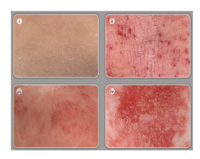
Figure 2. Close-up view of skin.