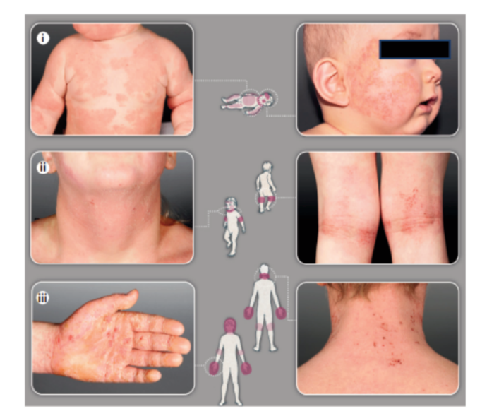
Figure 1. Typical clinical appearance and location of atopic dermatitis in infants.

For optimal disease management, patients and/or their caregivers should be educated about the chronic nature of the disease, the need for continued adherence to proper skin care practices, and the appropriate use and application of topical therapies. Poor treatment outcomes are often related to poor adherence, especially to