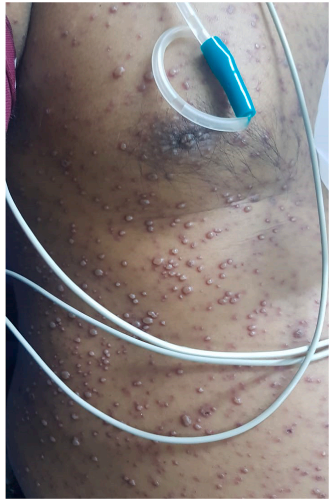
Fig. 1. Skin showed vesicles all over the body during hospital admission.

and wheezing on both hemithorax. The skin showed multiple vesicles filled with cloudy fluid with an erythematous macular base and multiple papules with an erythematous macular base, some erosion (Fig. 1).