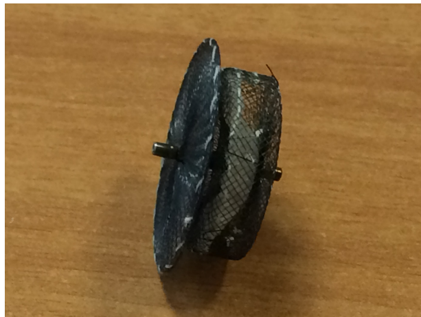
Figure 2 Amplatzer cardiac plug.

Last, the PREVAIL (Watchman LAA Closure Device in Patients With Atrial Fibrillation Versus Long Term Warfarin Therapy) study 46 was a randomized controlled trial including 269 patients in the Watchman LAA closure group compared with 138 patients in the warfarin group. Although the study group (Watchman) did not achieve the prespecified criteria for noninferiority at 18 months' follow-up compared with the control group (Warfarin), the overall periprocedural early events were lower than in the PROTECT AF trial, at 2.2% versus 4.9%, respectively. Overall, adverse events in the PREVAIL trial were significantly lower than in the PROTECT AF trial, at 4.2% versus 8.7% ( P=0.004 ).