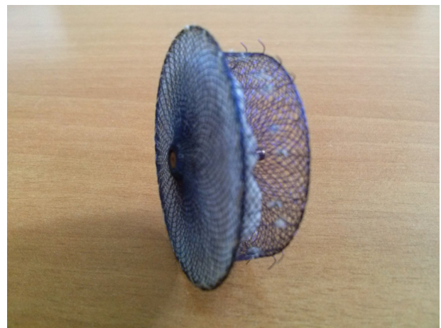
Figure 4 Amplatzer Amulet.

The newest Amplatzer Amulet (ACP-2) is the evolution of the original ACP device, a dedicated device for percutaneous LAA occlusion (Figure 4). The main design of the first