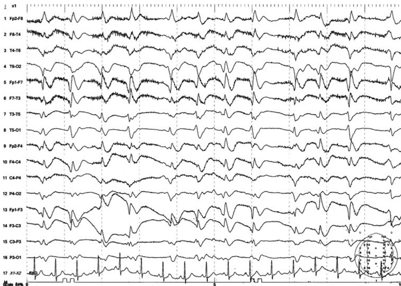
FIGURE 2 EEG showing periodic synchronized electric discharges on multiple EEGs refractory to seizure medication

Considering rapidly progressive dementia, myoclonus, akinesia, mutism, positive CSF 14-3-3 protein and RT-QuIC, MRI high-intensity signal abnormalities in the caudate nucleus on DWI and routine investigations that do not indicate an alternative diagnosis, the diagnosis of the patient is CJD, most probably the sporadic type. 8