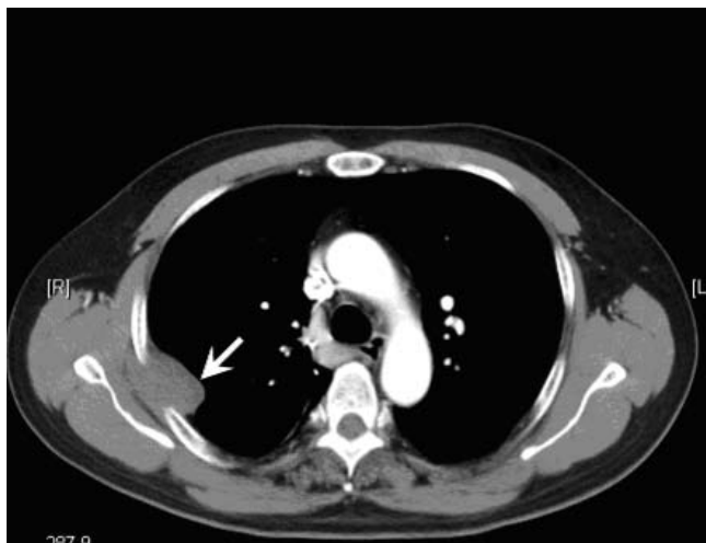
Figure 3 Chest computed tomography showing lung metastasis with pleural seeding 80 months after hepatectomy.

The patient presented with mild hemoptysis 30 months after the hepatectomy, and follow-up chest CT demonstrated a metastasis in the right lower lobe of the lungs. The metastasis was removed with wedge resection measuring 2 \times 1 \times 1 cm 3 . Histopathological examination confirmed the presence of metastatic HCC (Figure 2b).