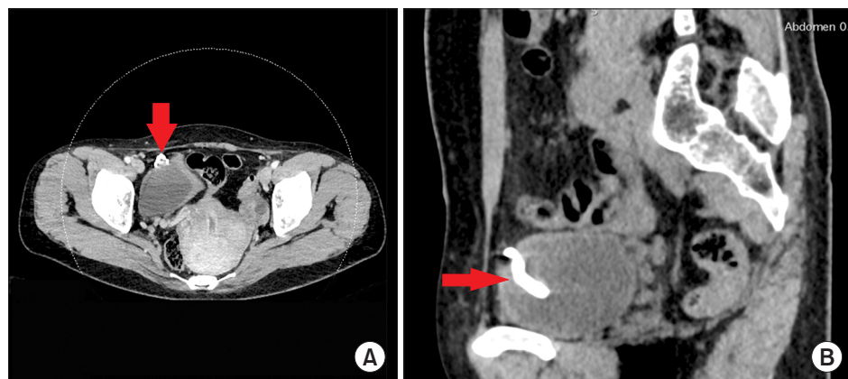
Fig. 1. Abdominal computed tomography (A: horizontal section. B: sagittal section) indicating a T-shaped intrauterine device embedded in the bladder wall (red arrow).

However, morbidity is high in this type of open surgery because adhesions resulting from chronic inflammation are common and extensive surgical exploration is usually required. There have been reports of laparoscopic management [4]. However, owing to adhesions, partially penetrated IUDs are often difficult to locate, the procedure can become difficult, and laparoscopic repair may not be feasible. We have introduced a combination of laparoscopy and carbon dioxide irrigated cystoscopy to minimize the morbidity associated with this procedure.