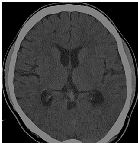
Fig. 2. Follow up brain CT scan shows dissolved pneumocephalus on next 16 days.