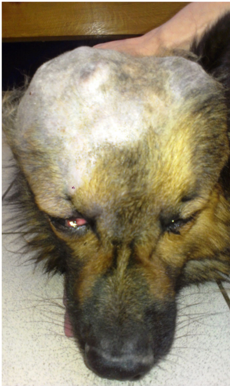
Fig 1 A 10-year old mixed breed dog with skull osteosarcoma

significant increase in mortality (Schmidt et al. 2013). Clinical signs depend on the location of primary tumors. In appendicular OSA, the typical clinical signs are: lameness (with or without noticeable pain) and local swelling at the tumor site, which is usually a consequence of the tumor's extension into the surrounding soft tissues (Brodey 1979; Jongeward 1985).