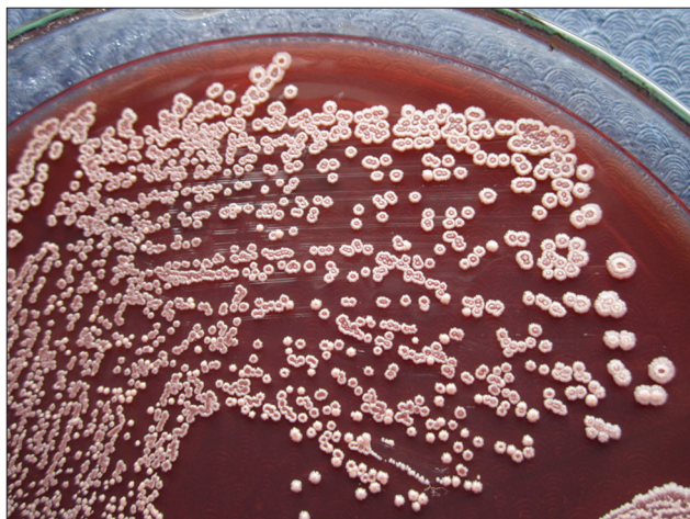
Figure 1: Wrinkled colonies on MacConkey's agar

Suppurative lymphadenitis caused by melioidosis has been rarely encountered by clinicians practicing in endemic areas. In the majority of previously described patients, the infected lymph nodes were in the head and neck region, except for four patients who presented with unilateral, inguinal lymphadenitis in the report of Maciej Piotr Chlebicki and Ban Hock Tan. [3] Here, we report a case of suppurative inguinal lymphadenitis caused by melioidosis in a 48-year-old lady who presented with groin swelling of 2 months duration which did not subside with antibiotics. This case report may increase the awareness among the clinicians to consider melioidosis as a differential