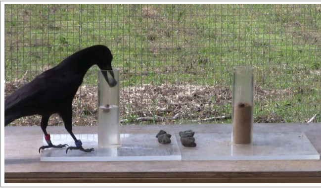
Figure 2. New Caledonian crow attempting the water vs. sand task. (in Jelbert et al., 4).

if they are denied visual feedback of the reward moving incrementally closer with each pull-step. 14 Furthermore, 11 NC crows all failed to solve a horizontal string pulling problem, using a coiled string, where their pulling efforts did not immediately bring the reward closer. 13 The requirement for visual feedback has also been found in primates, as apes could solve a ‘crank’ task when they had visual access to the incremental movement of the reward, but all subjects failed when this movement was concealed. 15