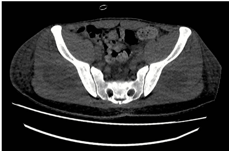
FIGURE 3: CT KUB showing swelling of the bilateral gluteus medius and minimus muscles with faint hypodense areas within, with overlying subcutaneous fat stranding and oedema

CT KUB: computed tomography of the kidneys, ureters, and bladder.