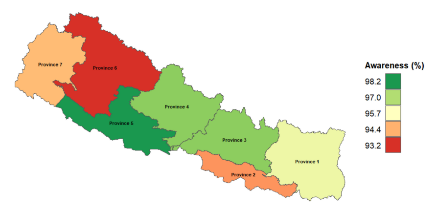
Figure 1. TB awareness at a subnational level in Nepal. Note: Provinces 1-7 represent the total number of provinces in Nepal. Province 1 = Not determined, Province 2 = Not determined, Province 3 = Bagmati, Province 4 = Gandagi, Province 5 = Lumbini, Province 6 = Karmali, Province 7 = Sudurpashchim.

The overall TB awareness at subnational levels in Nepal was above 90% across all provinces. Province 5 has the highest proportion of TB awareness (98.3%), followed by provinces 3 and 4 (97.4%); province 6 has the lowest awareness of all (93%) (Figure 1 & Appendix A Table A1).