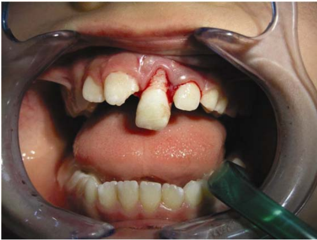
Figure 1. Clinical features of maxillary left central incisor.