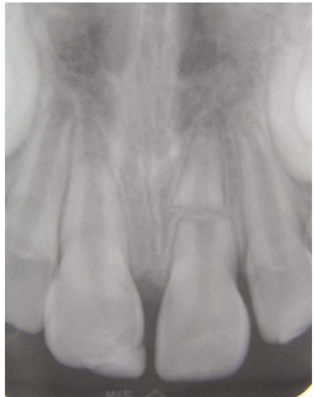
Figure 5. Radiographic image of the upper central incisors after 3 months and removing the splint.