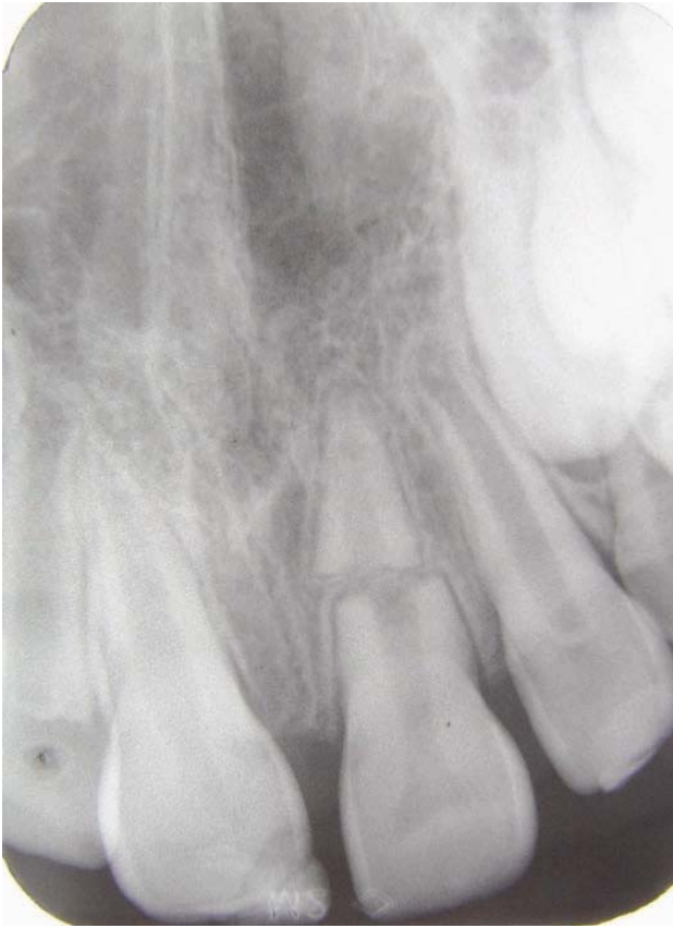
Figure 6. Radiographic image at 24-month follow-up, showing complete healing.

lutely necessary. In this case, the incisor was immature with a wide root canal and an open apex that favored pulp survival. Potential regenerative properties of the pulp in young permanent teeth such as in this case are worth waiting to obtain better healing of the root fracture.