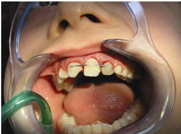
Figure 4. The splint was placed with stainless steel wire and fixed with light-cured composite resin.

In this case, referral time was an important factor. The displacement of the coronal part was so severe that favorable healing would have been compromised if the tooth had not been repositioned at the initial examination. Along with appropriate management, careful follow-up of trauma cases is abso-