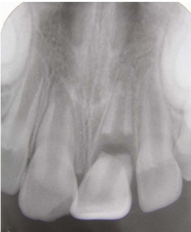
Figure 2. Radiographic image of the upper central incisors.

illary teeth underwent vitality tests. All the mandibular teeth responded to electric pulp tester (Vitality Scanner; Sybron Endo, Boston, MA) and cold test. The immediate treatment plan comprised reduction with gentle digital manipulation, repositioning and splinting of the coronal fragment under local anesthesia (2% lidocaine with 1:100000 epinephrine). Before splinting, for checking the optimal repositioning of the coronal fragment, the left central incisor was fixed to the left lateral incisor with composite resin (Figure 3a) and a radiograph confirmed proper coronal fragment repositioning (Figure 3b).