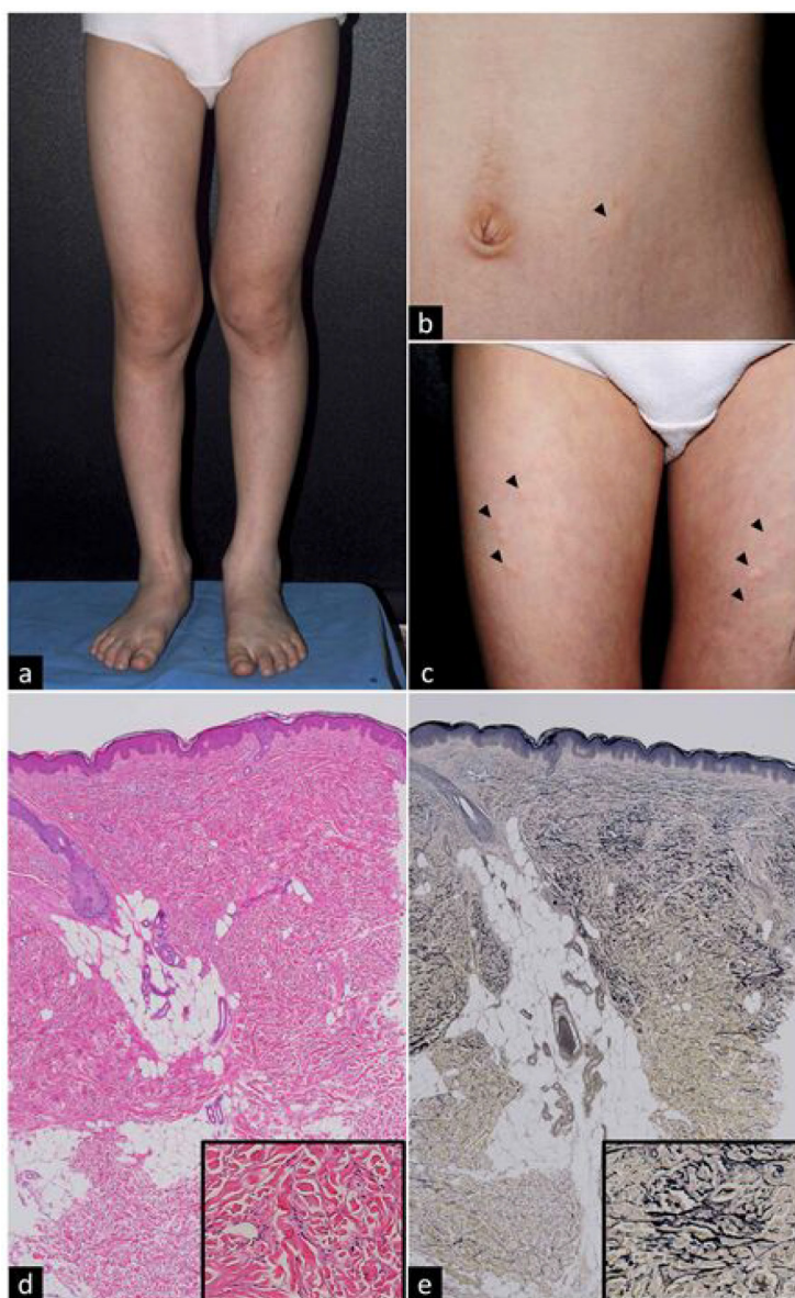
Figure 1. Clinical presentation and histopathologic examination. (a) Obvious leg length discrepancy with shorter right leg. (b) Skin-colored papules and plaques on the left abdomen. (c) Multiple skin-colored to yellowish papules coalescing to plaques symmetrically on the bilateral thighs. (d) Increased fibroblasts within dermal collagen bundles (hematoxylin and eosin staining, original magnification x100) (e) Foci of increased and thickened elastic fibers in the mid-dermis (Verhoeff-van Gieson stain, original magnification x100).

leg length discrepancy (LLD) (Figure 1a) was noticed. Lesional biopsy of the left thigh showed an increase in fibroblasts within dermal collagen bundles (Figure 1d). The Verhoeff-van Gieson stain revealed scattered foci of increased density of thickened elastic fibers between the collagen fibers, especially in the mid-dermis (Figure 1e).