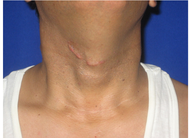
Figure 2: Patient Photo 6 months postoperative