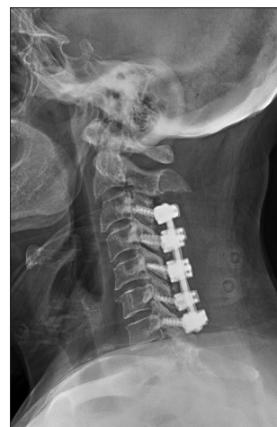
Figure 2: Lateral plain radiograph following C3-7 laminectomy and fusion demonstrating placement and trajectory of lateral mass screws

There was a 10.3% overall complication rate ( n = 6 ) that included minor complications. The most common complication, seen in four patients (6.9%), was a C5 nerve root palsy; all palsies completely resolved over a mean postoperative interval of 4 months (range 2 and 7 months). Other complications included one readmission for a fever of unknown origin, and one wound dehiscence of unknown etiology (e.g. no infection or seroma) that healed without further sequelae.