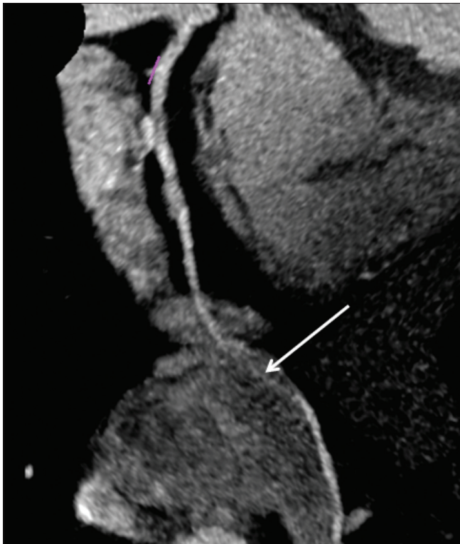
Figure 1: Maximum intensity projection (MIP) image shows intracavitary course of segment 3 (arrow) of the RCA