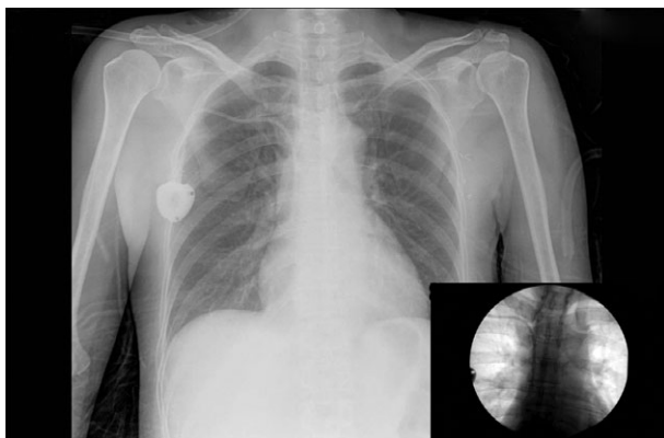
Figure 1 Chest X ray confirming the position of the central venous catheter.

Anthracyclines have the potential to cause the most damage or complications because they bind to the DNA of healthy tissue when they leak out of a vein. This process causes cell death and continues to do so as more of the drug is released into the surrounding tissue, causing pain, as in the described case. 2